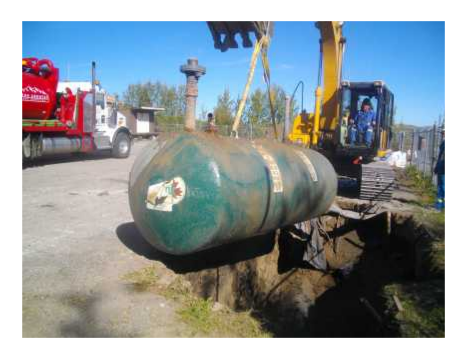
Example of an Underground Storage Tank Removal.