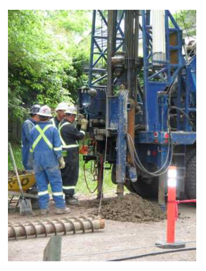
Monitoring well abandonment 2008.