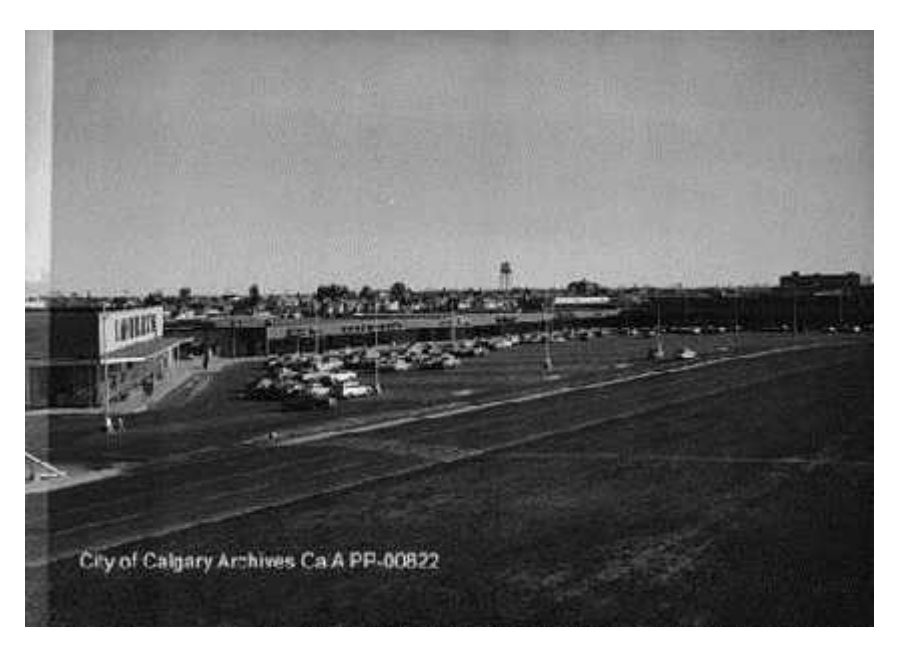
North Hill Mall