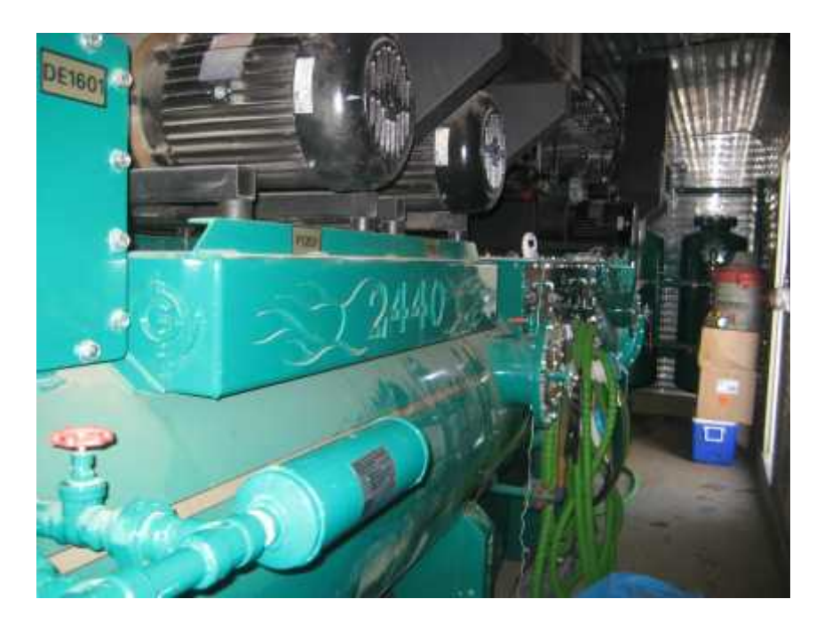
DPVE treatment system in Lions Park.