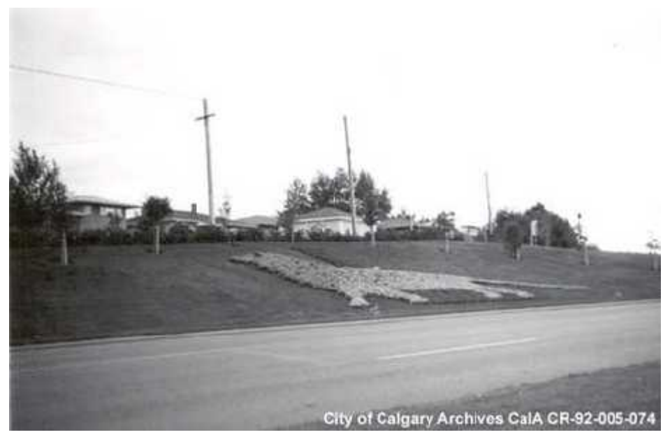
Lions Park