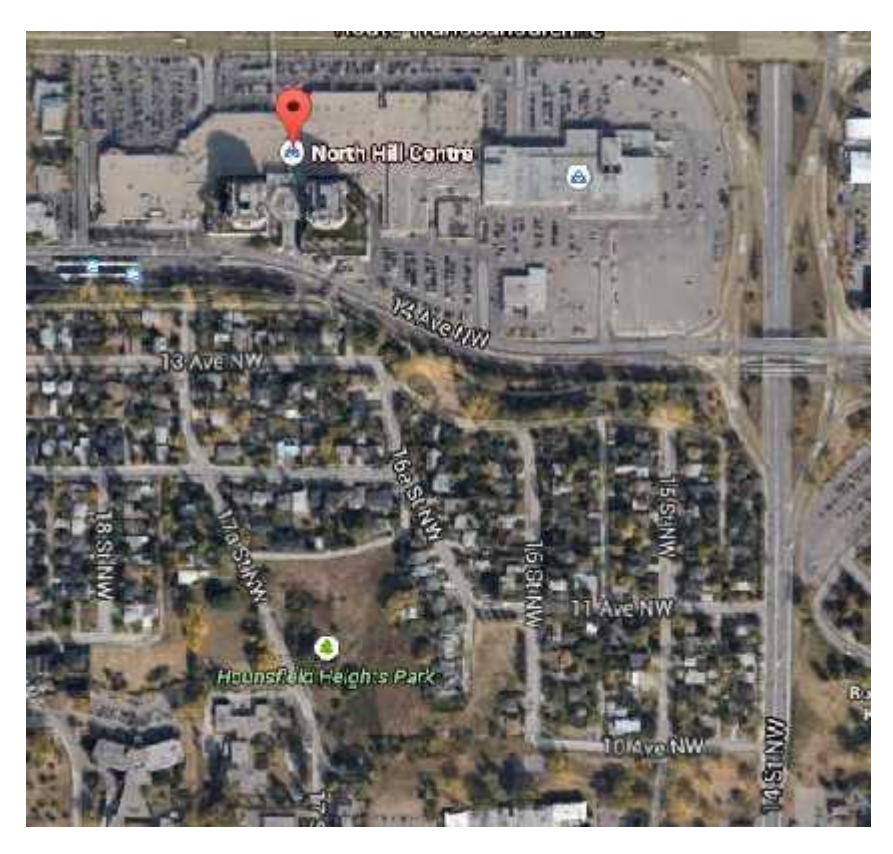
Aerial Photograph of the Site area