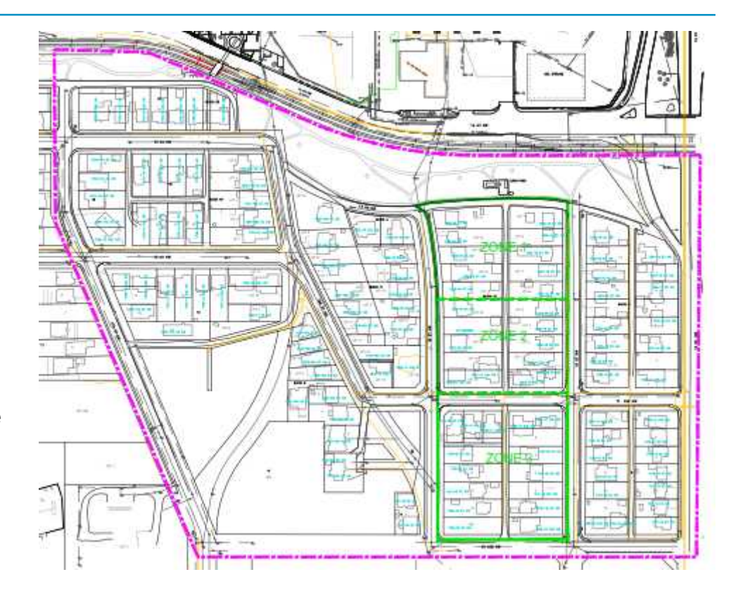
The Revised Site Area Map