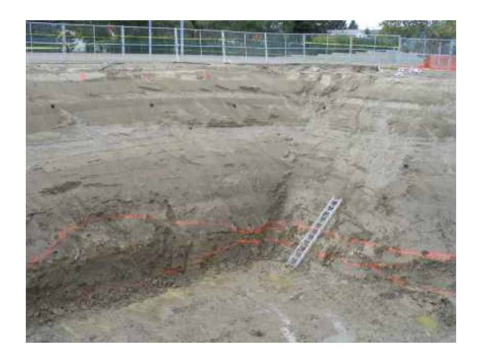
Secondary source removal to the east of Kal Tire